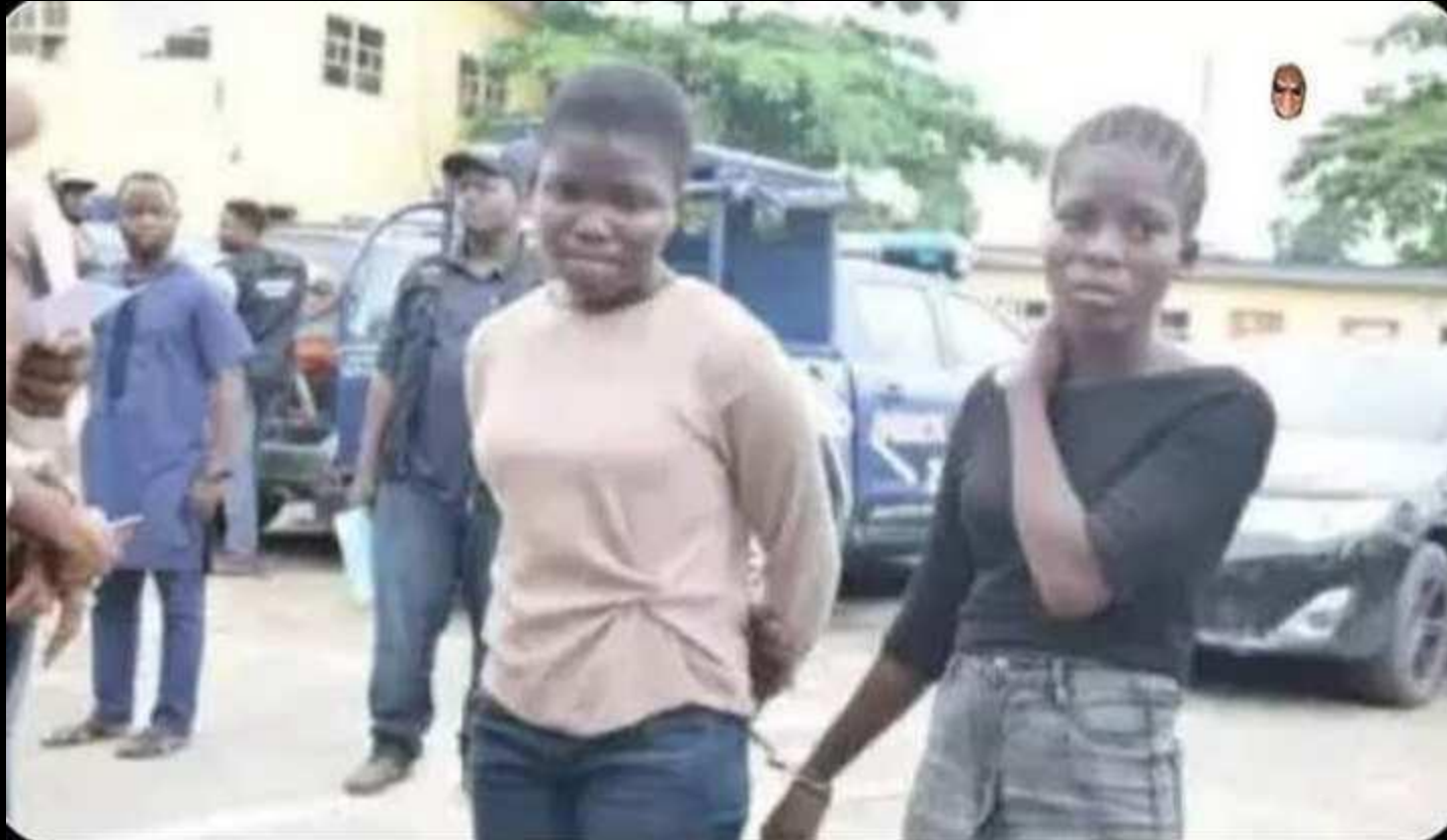
Two teenage girls arrested in April 2020 sentenced to death by hanging by Enugu high court in 2022 for killing Delta parents